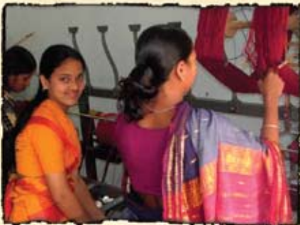
A Salvation Army program in Bangladesh helps women develop the work skills necessary to prevent them from being trafficked, or to help restore the lives of those already trafficked.

The sex industry in the Netherlands is estimated to make almost $1 billion each year. (UNECE, 2004) It is a major Western European destination country for trafficked women with 2000 brothels and numerous escort services, using an estimated 30,000 women. (D. Hughes, 2002) Conservatively, 68-80% of women in its sex industry are from other countries, a factor highly indicative of sex trafficking.