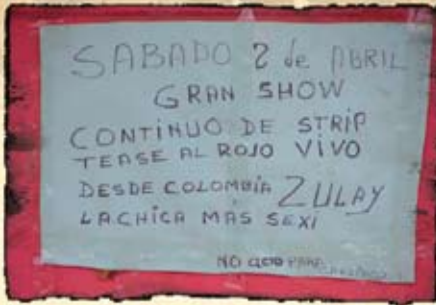
This sign on a strip club in Ecuador announces a show with girls from Colombia.

He says to himself, "God has forgotten; he covers his face and never sees."