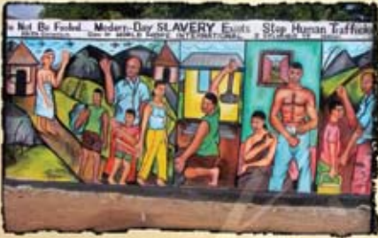
A mural in West Africa warns community residents about trafficking in persons.